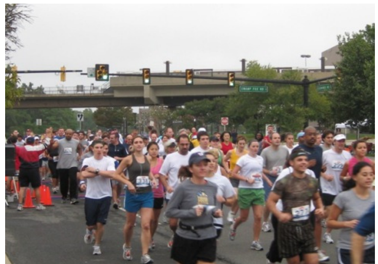
Alexandria, VA — Commencement of the Race