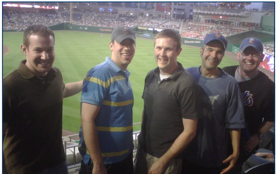
NJSS Members and Mets enthusiasts enjoying the game.