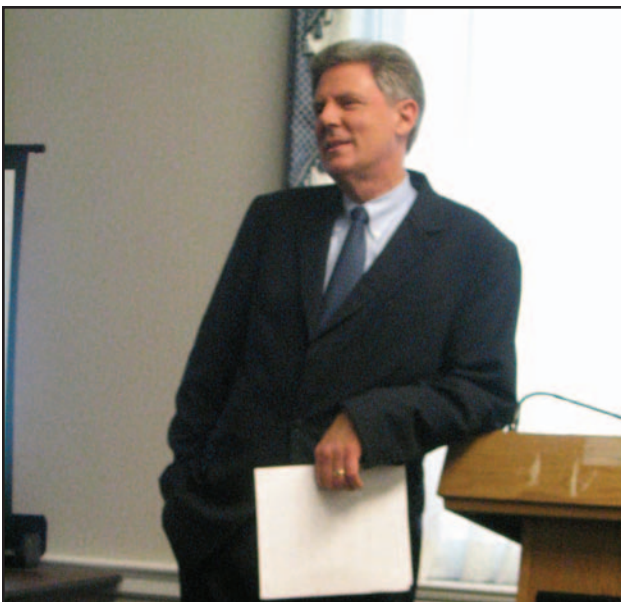
Congressman Frank Pallone, Jr. (NJ- 6th) offers his perspective.