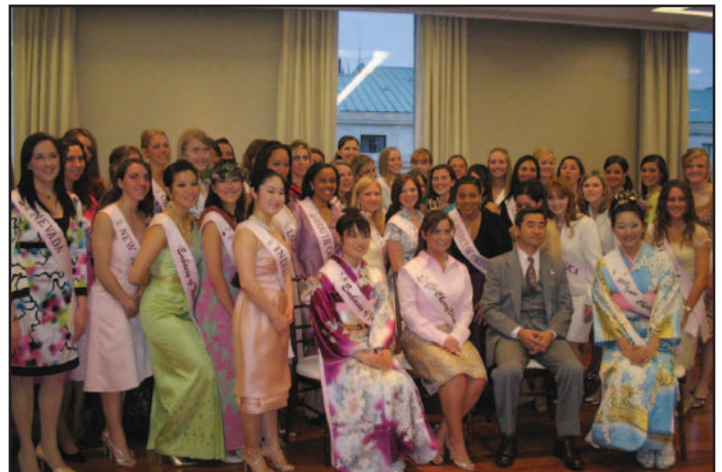
Cherry Blossom Princess Representatives from the States, territories, and embassies honored at the 2007 National Cherry Blossom Festival.