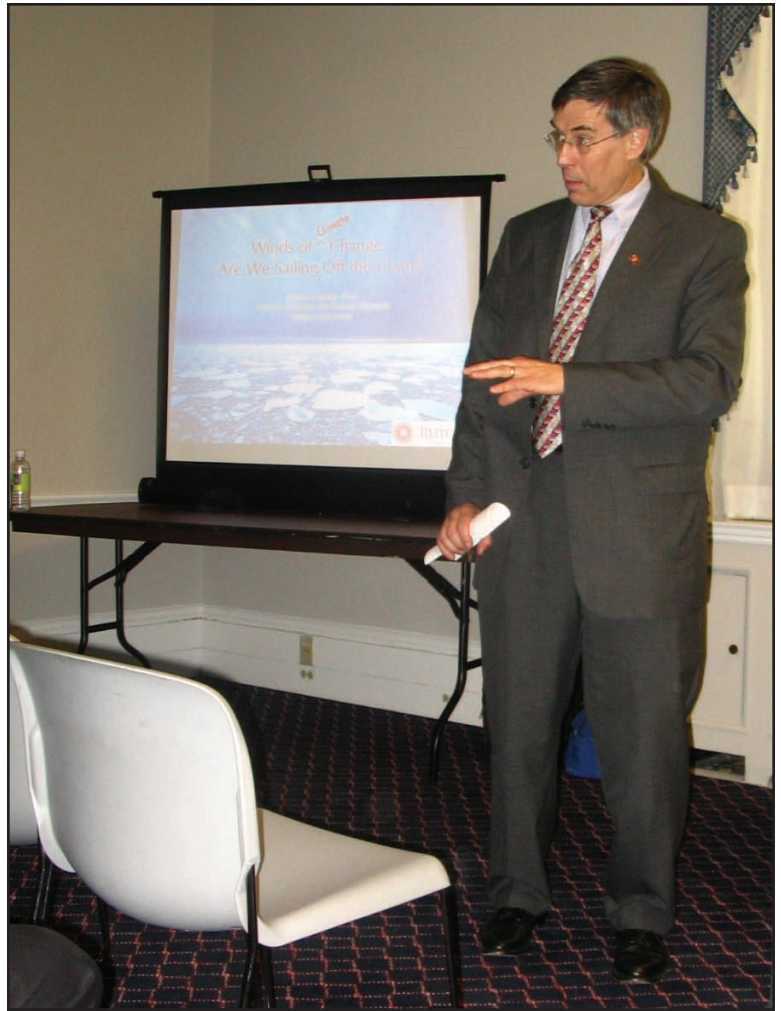
Congressman Rush Holt (NJ- 12th) addresses the audience.